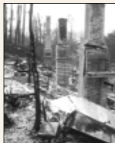
Witchell's sweet pad before, during and after the deadly blaze

THE UNICORN: "You could smell melting chocolate and marshmallow for miles. It was kinda like a giant s'more."