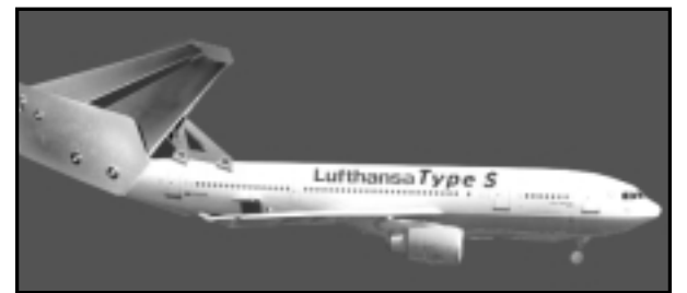
Lufthansa's new Type S aircraft will ride on sixties and feature chrome two-piece dubs, curb feelers, carbon fiber cockpit trim and neon landing lights.