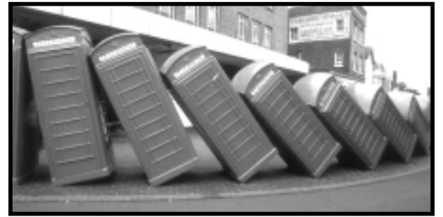
The ill-winds of change in Berlin.