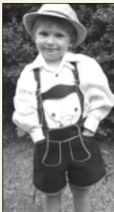
Hansel's evil smile: Remorse? No. Cavities? Yes.

A PIXIE: "Let's not overlook who's really to blame here - the builder. Insulating a home with Pop Rocks is just irresponsible. As soon as it caught fire the whole house exploded."