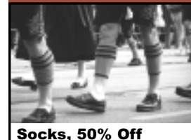
Socks, 50% Off

UConn Health Center Study Reveals German Measles 65% More Stubborn than American Variety