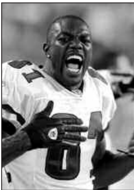
Of T.O.’s punishment, NFL commissioner Roger Goodell says, “If he’s gonna act like a child, we’ll treat him like child.”

For brand new NFL commissioner Roger Goodell, the last straw came late in the fourth quarter of last Sunday’s game. Owens grabbed the game ball out of the referee’s hands and stormed off the field shouting, “I’m going home and I’m taking my ball with me.” The game was delayed for two hours until coach Bill Parcells managed to get the ball back by saying to Owens, “C’mon. Let me just see it for a second. Pleeeeease. I swear I’ll give it right back.”