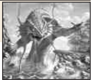
RIGHT: Biologists believe Tappie may look something like this.

Keep small children clear of the shoreline and don't dangle bar bites over the patio railing."