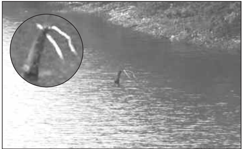
ABOVE: This unretouched photograph of Tappie surfacing to sneak a peak at patio-goers is causing quite a stir.