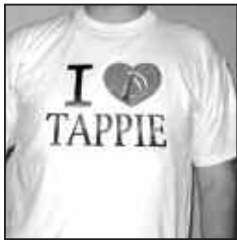
"Tappie Fever" is spreading throughout Greater Hartford!