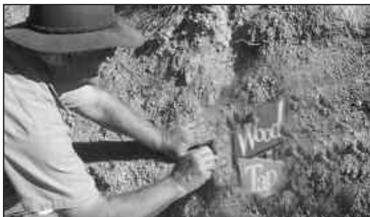
One of the dig's organizer's carefully uncovers a Wood-n-Tap takeout menu believed to be more than 40 million years old.

ROCKY HILL – It's being called one of the most important archaeological finds of the 21st century. A group of 7th grade students on a fossil dig in Rocky Hill uncovered an almost perfectly-preserved Wood-n-Tap restaurant believed to be more than 40 million years old. The students were taking part in an educational outreach program called, "Archaeology. Can You Dig It?!" sponsored by nearby Dinosaur State Park.